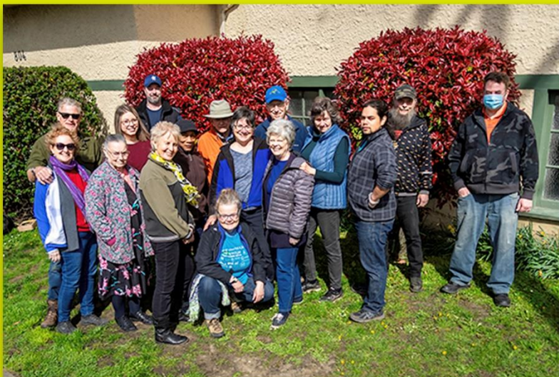
Our Quadra Village Team