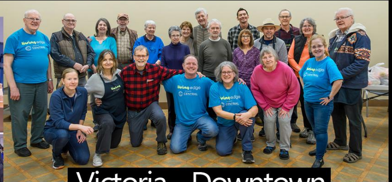
Victoria - Downtown