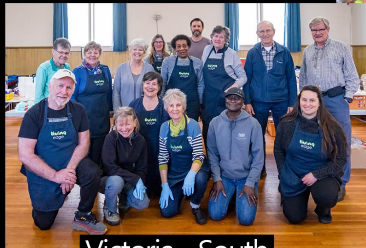
Victoria - South